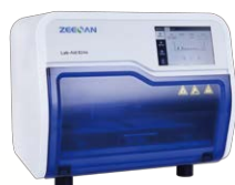
Automated DNA Extraction (Up to 96 samples)