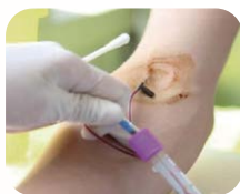
Sample Collection (Human Peripheral Blood)