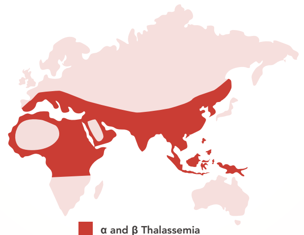
The Global Distribution of α and β Thalassemia

♦ Real-time PCR test is one of the most sensitive and efficient methods to investigate mutations and deletions in α and β thalassemia relevant genes, which can help diagnose thalassemia and determine carrier status.