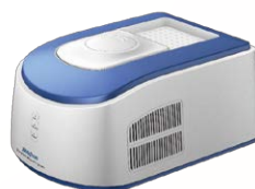
qPCR Detection (Up to 94 samples)