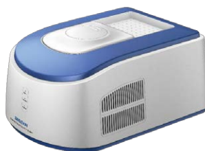
qPCR Detection (Up to 96 samples incl. positive/negative controls)