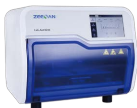
Automated Nucleic Acid Extraction (Up to 96 samples)